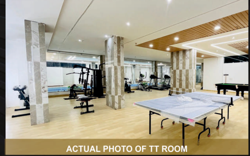
ACTUAL PHOTO OF TT ROOM