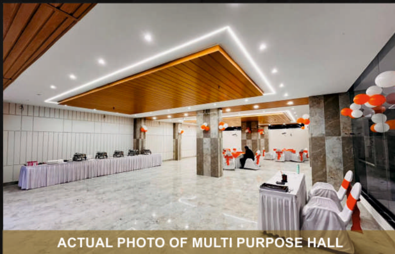
ACTUAL PHOTO OF MULTI PURPOSE HALL