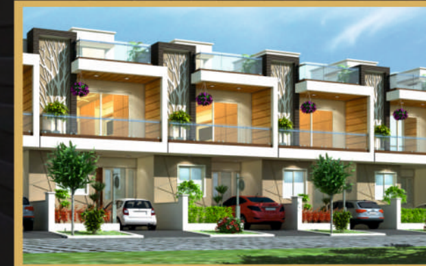
KIARA VILLE NEAR AKSHAY PATRA