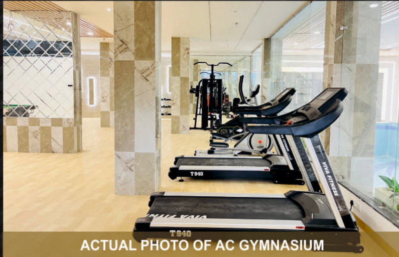
ACTUAL PHOTO OF AC GYMNASIUM