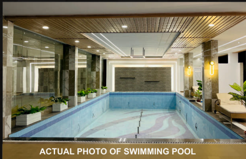
ACTUAL PHOTO OF SWIMMING POOL