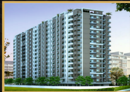
D'TERRACE VUE 2 & 3 BHK APARTMENT OPP. ANUKAMPA PLATINA, MANSAROVAR