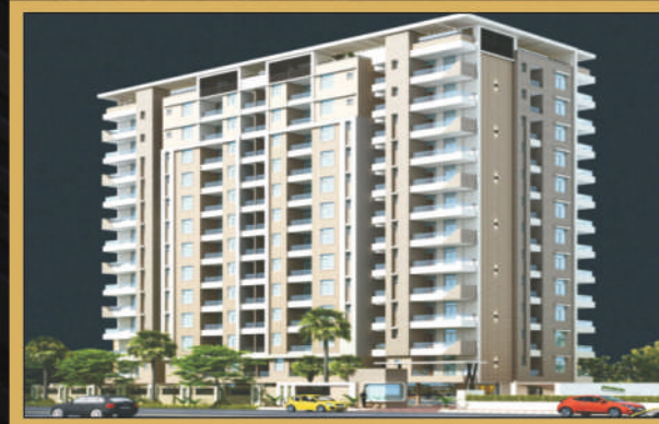
KIARA APARTMENT NEAR. 7 NO. CHAURAHA