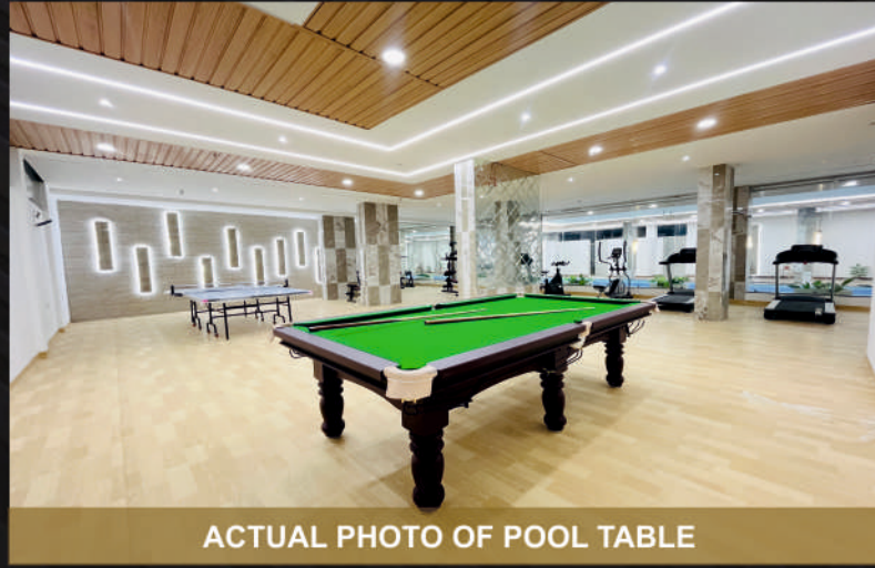
ACTUAL PHOTO OF POOL TABLE