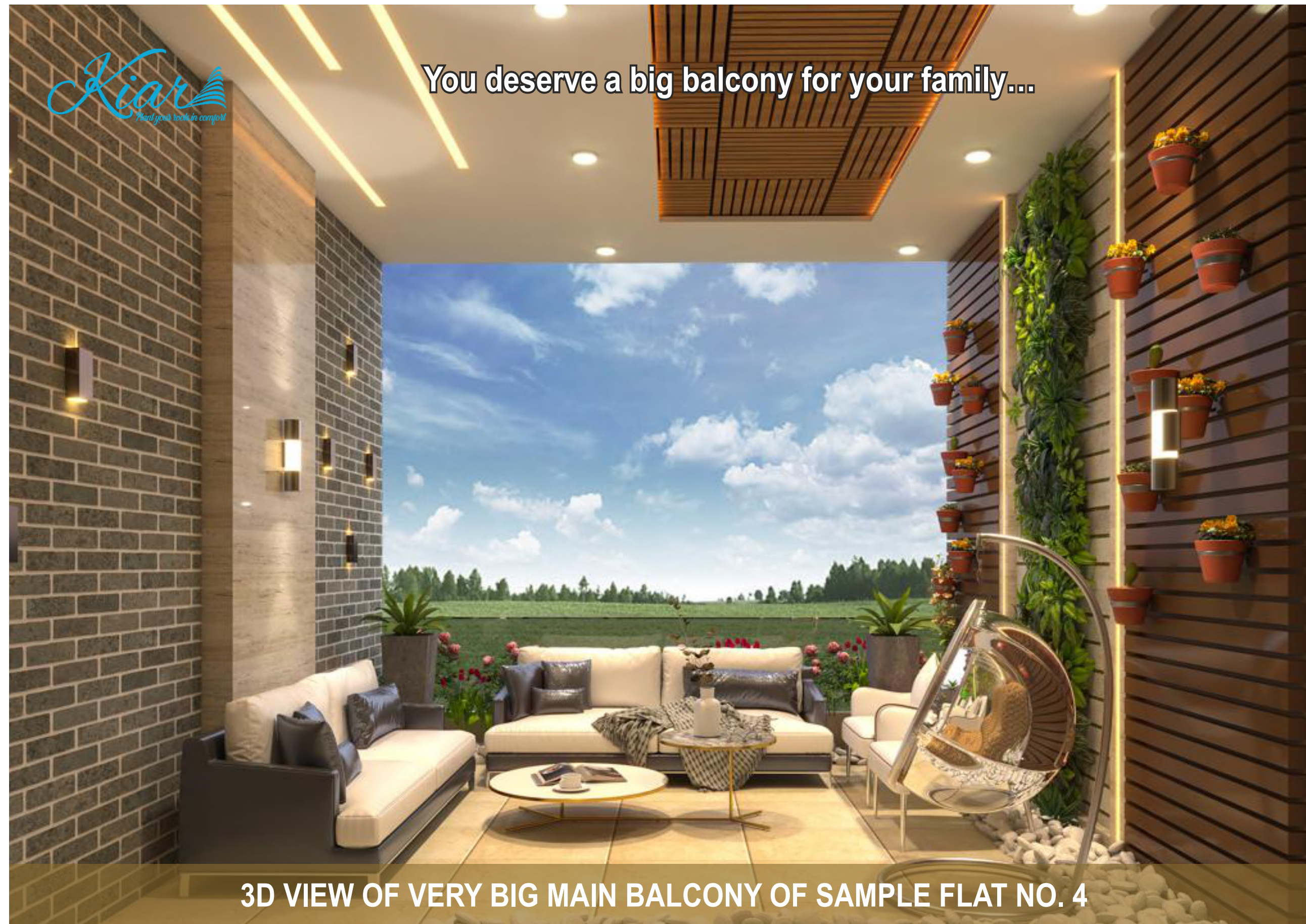
3D VIEW OF VERY BIG MAIN BALCONY OF SAMPLE FLAT NO. 4