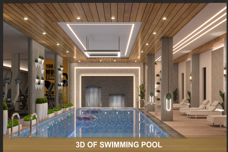
3D OF SWIMMING POOL