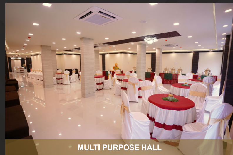
MULTI PURPOSE HALL