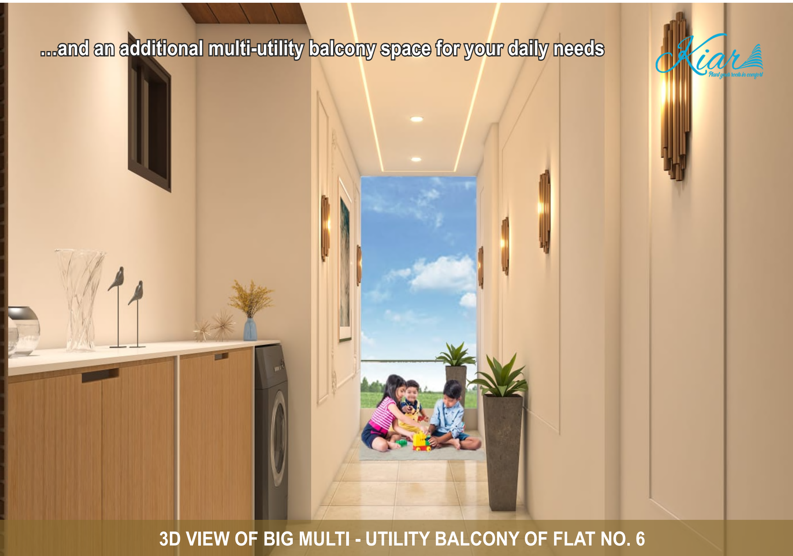
3D VIEW OF BIG MULTI - UTILITY BALCONY OF FLAT NO. 6

...and an additional multi-utility balcony space for your daily needs